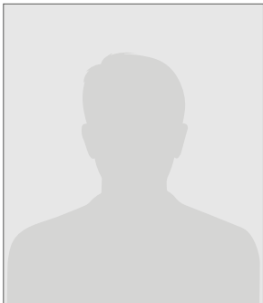
TO BE ANNOUNCED Managing Director (Nairobi)